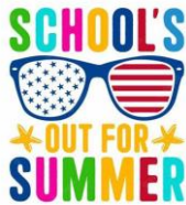
St. Theresa School at Kekaha

Vision/Mission Statement To make St. Theresa Parish a dynamic Christian community of worship & service