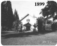
Sacred Heart of Jesus & Mary at Waimea

FOR WHOSOEVER SHALL DO THE WILL OF GOD, THE SAME IS MY BROTHER, AND MY SISTER, AND MOTHER.