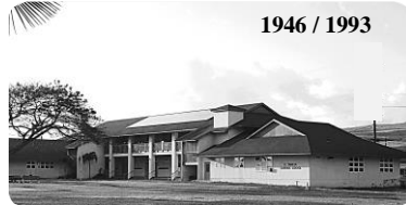
1946 / 1993