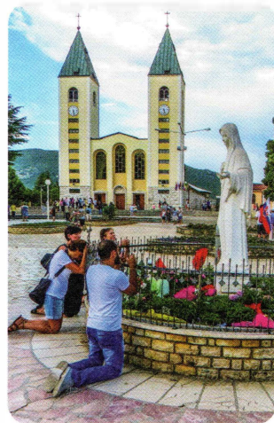
PRAYING IN FRONT OF THE STATUE OF OUR LADY MARY, MEDJUGORJE, BOSNIA AND HERZEGOVINA.

It is important to note whether the private revelation is contrary to the faith or the morals of the Church, and whether a particular revelation brings one closer to God. ●