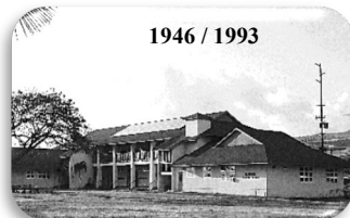
St. Theresa School at Kekaha

Vision / Mission Statement To make St. Theresa Parish a dynamic Christian community of worship & service