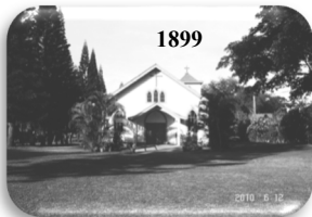
Sacred Heart of Jesus & Mary at Waimea