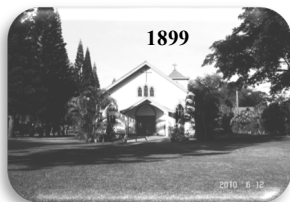
1899 Sacred Heart of Jesus & Mary at Waimea