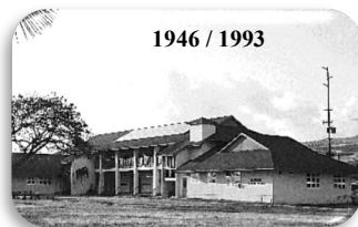
1946 / 1993 St. Theresa School at Kekaha

Vision / Mission Statement To make St. Theresa Parish a dynamic Christian community of worship & service