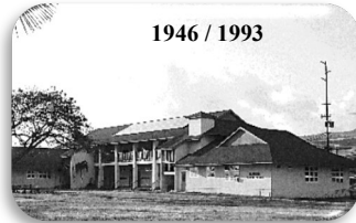
1946 / 1993 St. Theresa School at Kekaha