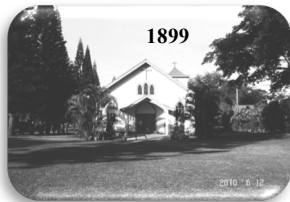
1899 Sacred Heart of Jesus & Mary at Waimea