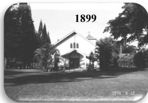
Sacred Heart of Jesus & Mary at Waimea