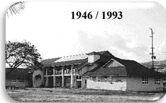
St. Theresa School at Kekaha

Vision / Mission Statement To make St. Theresa Parish a dynamic Christian community of worship & service