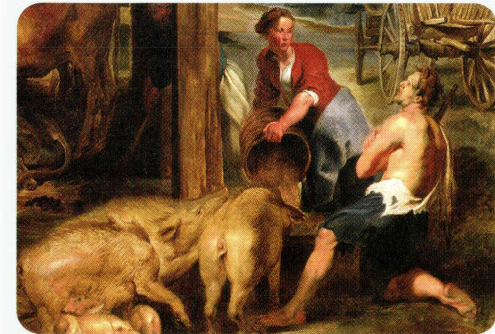
THE PRODIGAL SON, PETER PAUL RUBENS

There was a pop theatre production...about the prodigal son.... [The son writes a letter]: "Father, I have repented, I want to come back home.... If you want to welcome me, please put a white handkerchief in the window." And when he was near home...what did he see? Not one handkerchief: it was full of white handkerchiefs, the windows, everywhere!