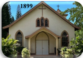
Sacred Hearts of Jesus & Mary at Waimea

Established January 21, 1941 P.O. Box 159, Kekaha, HI 96752