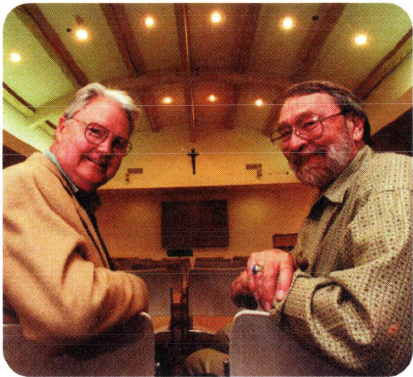
A candidate and his sponsor sit for a photo after an Order of Christian Initiation for Adults (OCIA) class.

The first step is to celebrate the sacrament of reconciliation (confession). This is a wonderful opportunity to be officially welcomed back into full practice with the Church. After such a long absence, it is important to examine your conscience and celebrate the forgiveness of the Lord before you receive holy Communion. I would also recommend that you “beef up” your understanding of what it means to be a practicing Catholic. You might do this by participating in your parish's process for the Christian Initiation of Adults (called OCIA or sometimes RCIA). The Liguori Publications program, Journey of Faith , is one resource used by many parish communities. Another possibility is to use some of the resources offered online, such as Bishop Robert Barron’s Word on Fire website, which has a fine reputation. I am happy you have responded to the stirrings of the Holy Spirit within you and answered the call to deepen your spiritual practice and journey. The Church needs you. The people of God welcome you. You are beloved among us, and your response in faith is a powerful witness, a reminder to those who may be tempted to take for granted the gift of faith. Thank you. ●