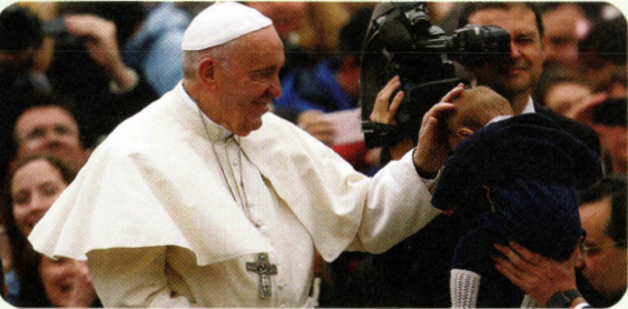
CATHOLIC NEWS SERVICE