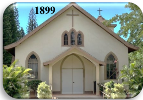
Sacred Hearts of Jesus & Mary at Waimea

God mounts his throne to shouts of joy: a blare of trumpets for the Lord.