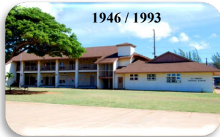
St. Theresa School at Kekaha

Vision / Mission Statement To make St. Theresa Parish a dynamic Christian community of worship & service