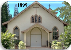
1899 Sacred Hearts of Jesus & Mary at Waimea