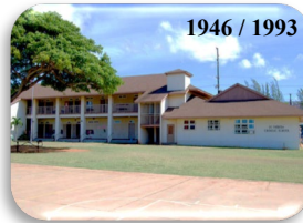
1946 / 1993 St. Theresa School at Kekaha

1940 / 1978 Vision / Mission Statement To make St. Theresa Parish a dynamic Christian community of worship & service