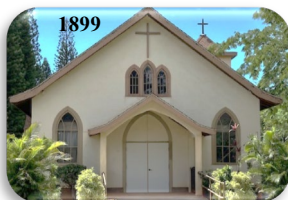
Sacred Hearts of Jesus & Mary at Waimea