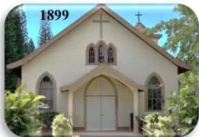
Sacred Hearts of Jesus & Mary at Waimea