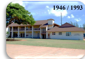
St. Theresa School at Kekaha