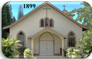
Sacred Hearts of Jesus & Mary at Waimea