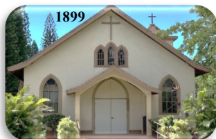
Sacred Hearts of Jesus & Mary at Waimea