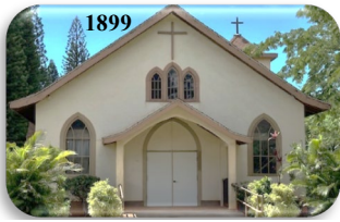
Sacred Hearts of Jesus & Mary at Waimea