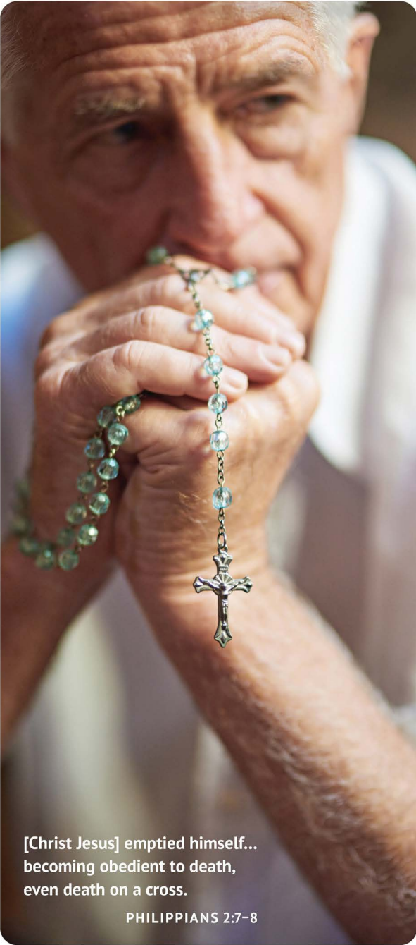
[Christ Jesus] emptied himself... becoming obedient to death, even death on a cross.

Reflect What emptying am I experiencing? Can I accept it as becoming more like Jesus?