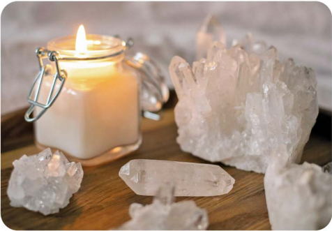
PIA TERRELLA AND CRYSTALS / PAPER 5

Go to DearPadre.org to send your question and to learn more about Dear Padre .