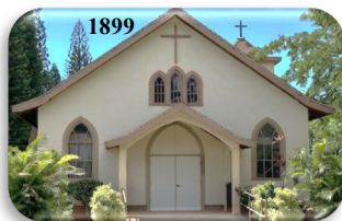
Sacred Hearts of Jesus & Mary at Waimea