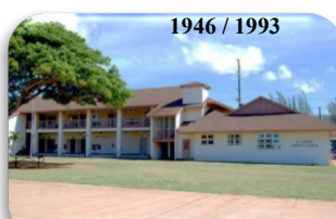
St. Theresa School at Kekaha