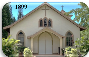
Sacred Hearts of Jesus & Mary at Waimea