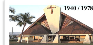
1940 / 1978

Established January 21, 1941 P.O. Box 159, Kekaha, HI 96752