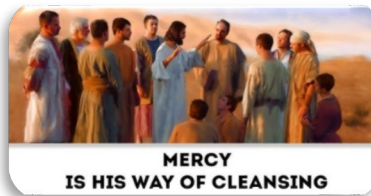
MERCY IS HIS WAY OF CLEANSING

Vision / Mission Statement To make St. Theresa Parish a dynamic Christian community of worship & service