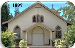
Sacred Hearts of Jesus & Mary at Waimea