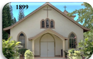
Sacred Hearts of Jesus & Mary at Waimea