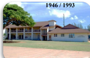
St. Theresa School at Kekaha

Vision / Mission Statement To make St. Theresa Parish a dynamic Christian community of worship & service