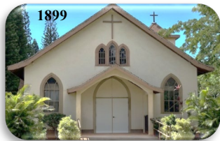
Sacred Hearts of Jesus & Mary at Waimea