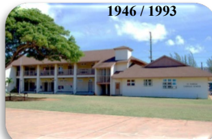
1946 / 1993 St. Theresa School at Kekaha

With the Lord there is mercy and fullness of redemption.