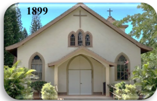
1899 Sacred Hearts of Jesus & Mary at Waimea