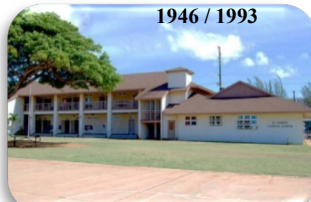
1946 / 1993 St. Theresa School at Kekaha

"My God, my God, why have you abandoned me?"