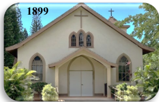
1899 Sacred Hearts of Jesus & Mary at Waimea