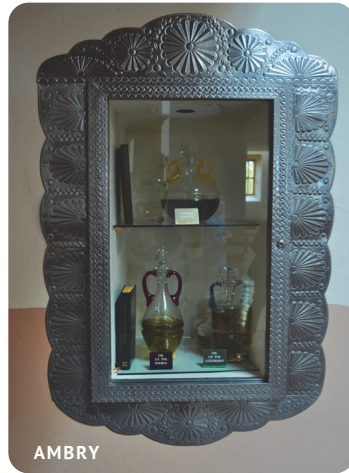
JOHAN VAN PARYS

A repository for the oils—often marked Olea Sanctae (“Holy Oils”)—is called an ambry . It is usually in a prominent church location near the baptismal font. Each year, when the oils are replaced, a priest, sacristan, or other person may absorb the old oil with cotton and burn it in a thurible or as part of the fire that begins the Easter Vigil. With special care, old oil can also be added to a large burning candle, like the sanctuary lamp. Reverence and safety are proper for whatever method of disposal is used. ●