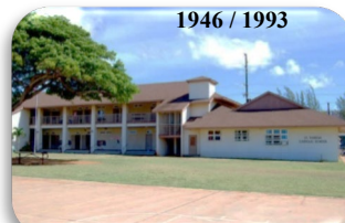
1946 / 1993 St. Theresa School at Kekaha

Vision / Mission Statement To make St. Theresa Parish a dynamic Christian community of worship & service