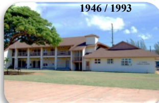
1946 / 1993 St. Theresa School at Kekaha