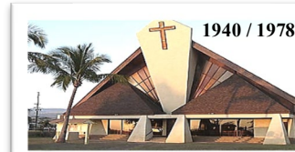
1940 / 1978

Established January 21, 1941 P.O. Box 159, Kekaha, HI 96752