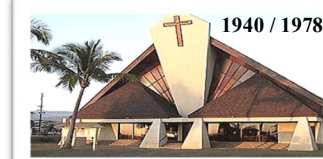
1940 / 1978

Established January 21, 1941 P.O. Box 159, Kekaha, HI 96752