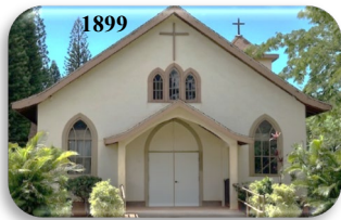
1899 Sacred Hearts of Jesus & Mary at Waimea