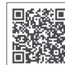
LEARN ABOUT THE AUTHORS OF OUR PARISH COMMUNITY

The community/communion of the triune God—Father, Son, and Holy Spirit—is the perfect witness to the truth that mystery creates. One God, three divine persons. The Eucharist that we celebrate on this day proclaims the unity of our belief—to the Father, through the Son, by the power of the Holy Spirit. ●