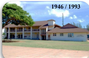
1946 / 1993 St. Theresa School at Kekaha

Vision / Mission Statement To make St. Theresa Parish a dynamic Christian community of worship & service