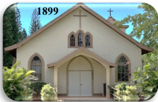
1899 Sacred Hearts of Jesus & Mary at Waimea